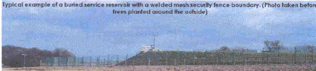
Typical example of a buried service reservoir with a welded mesh security fence boundary. (Photo taken before trees planted around the outside)

Aerial view of existing reservoir showing proposed adjacent buried reservoir, new vehicular access, fencing, hedge planting and temporary contractors site compound.